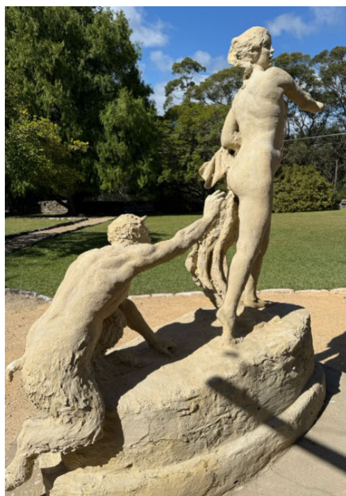
The 1994 film "The Sirens" was set in the gardens amongst his voluptuous works, illustrating his sybaritic lifestyle.