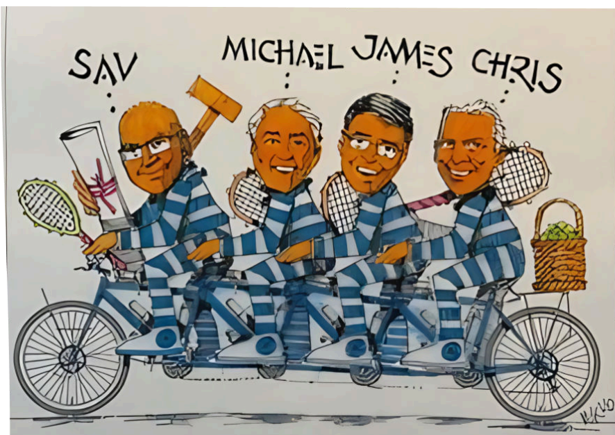
Sav has the plans as they approach the finish line (drawing courtesy of Mikko)