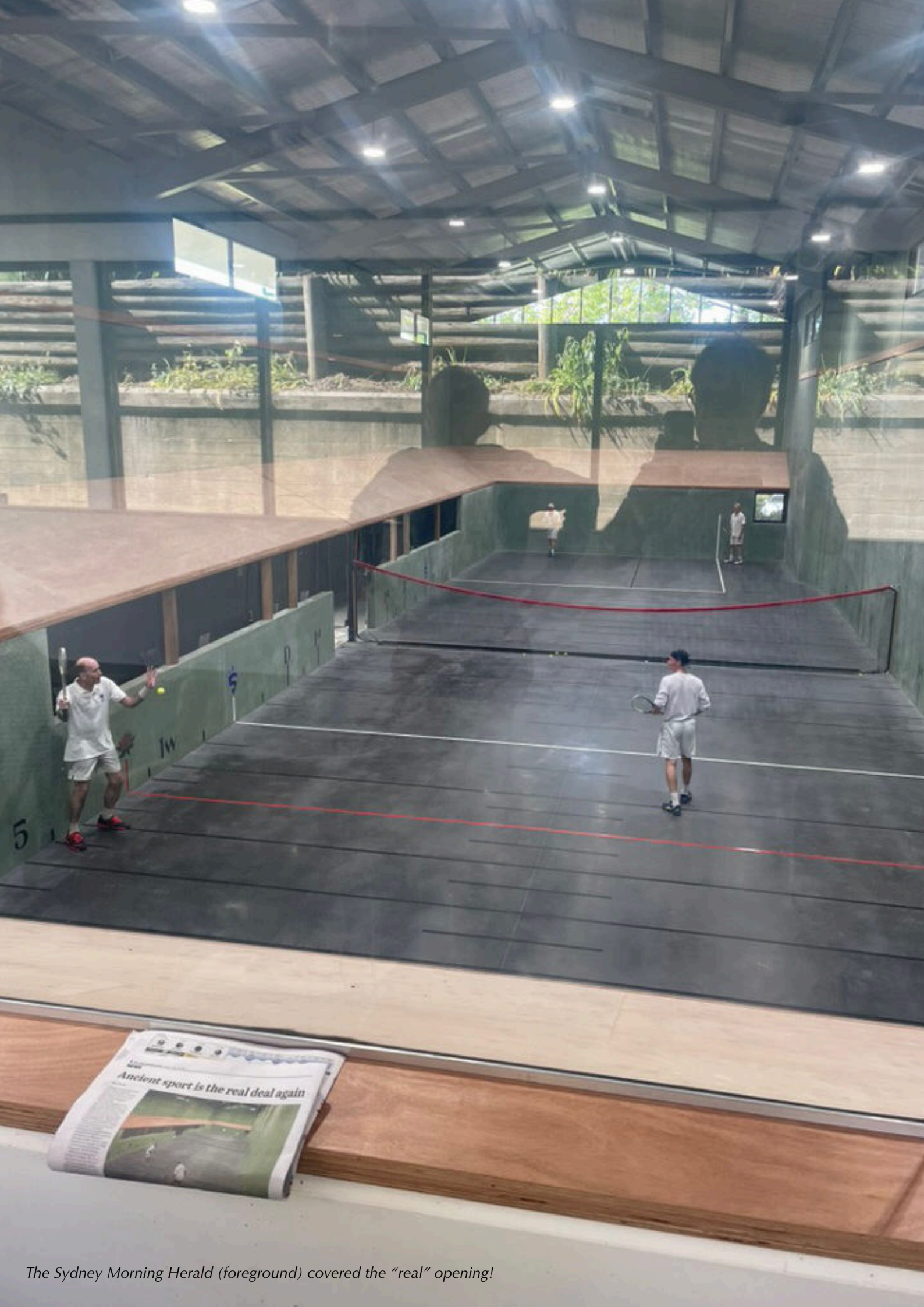
The Sydney Morning Herald (foreground) covered the "real" opening!