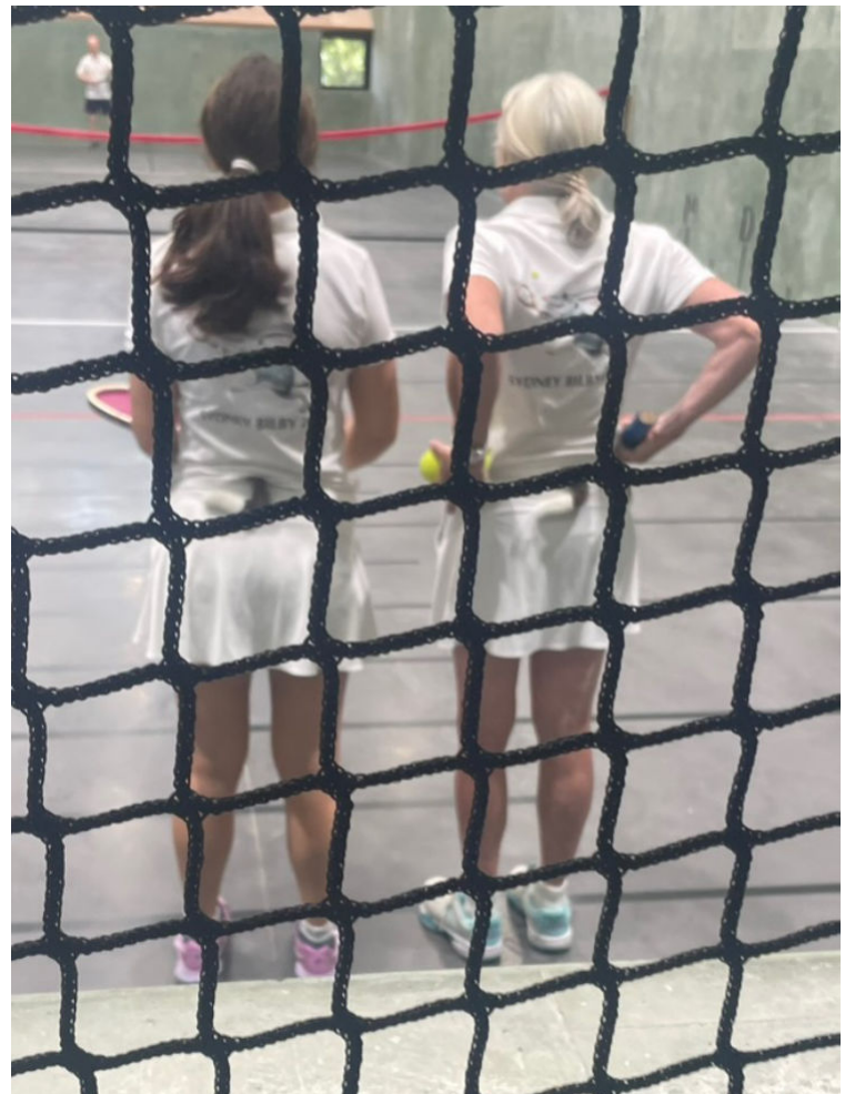
Like mother like daughter: the McCahey girls with their cute Bilby tails